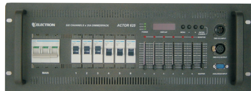
ACTOR 625 with MCBs P+N