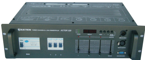
ACTOR 325 with RCD & MCBs P+N