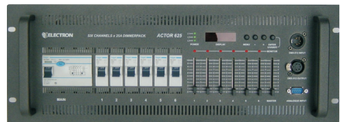
ACTOR 625 with RCD & MCBs P+N