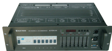
ACTOR 616 with RCD & MCBs P+N