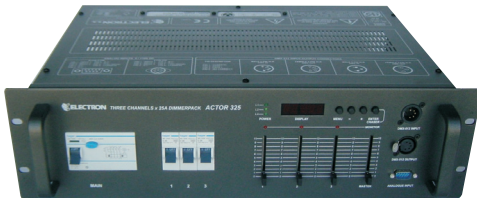
ACTOR 325 with RCD