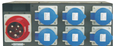
Rear side of ACTOR 625