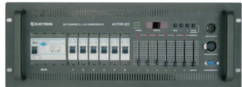
ACTOR 625 with RCD