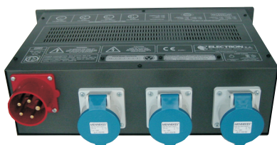
Rear side of ACTOR 325