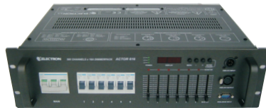
ACTOR 616 with MCBs P+N