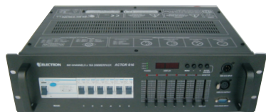
ACTOR 616 with RCD