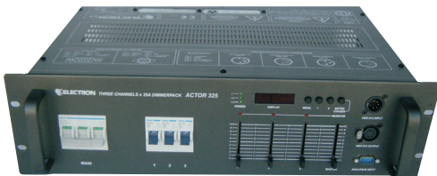
ACTOR 325 with MCBs P+N