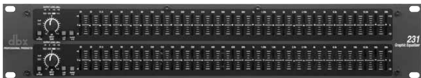
231- Dual Channel 31 Band Graphic EQ

Input Gain Control: This control sets the signal level to the equalizer. It is capable of -12dB to +12dB of gain. Its effect is apparent by viewing the OUTPUT LEVEL BAR GRAPH.